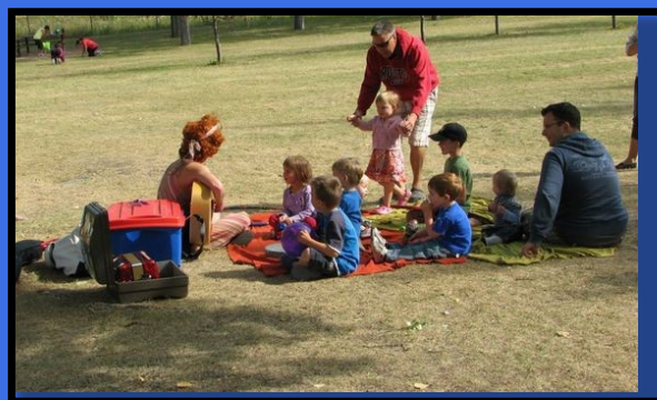
Made by Momma—Volunteer Picnic